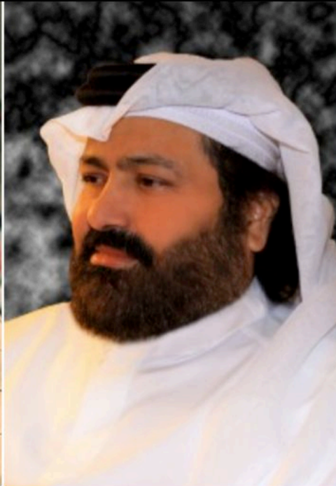
Abdullah bin Khalid al-Thani - Qatar government minister