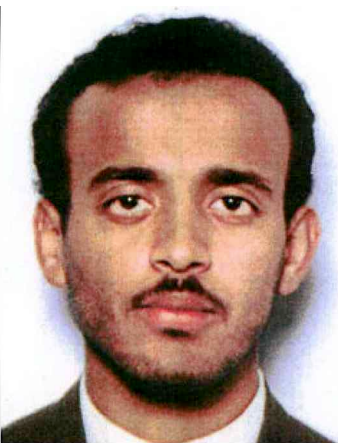
Ramzi bin al-Shibh Guantanamo detainee